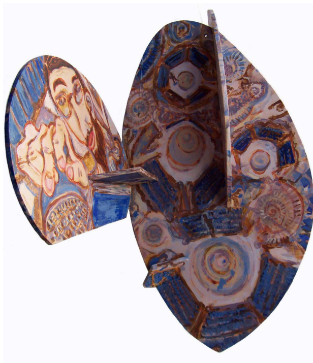
Figure 1: Borges' Library of Babel (View of Apollonian Ventilation Shafts).