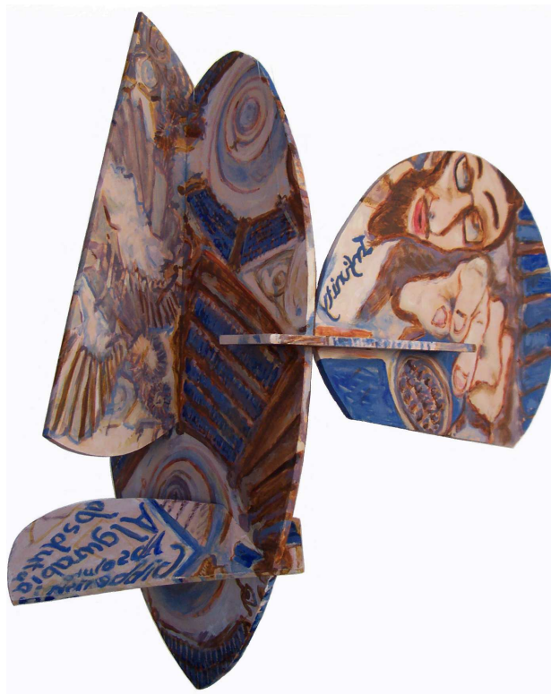
Figure 2: Borges' Library of Babel (Other View).